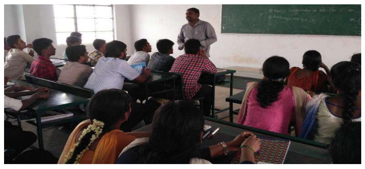
Resource person interact with students about their career