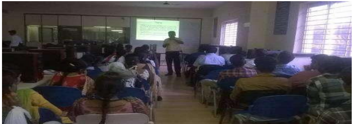
Virtual Lab Session on Cloud Computing for IV Year