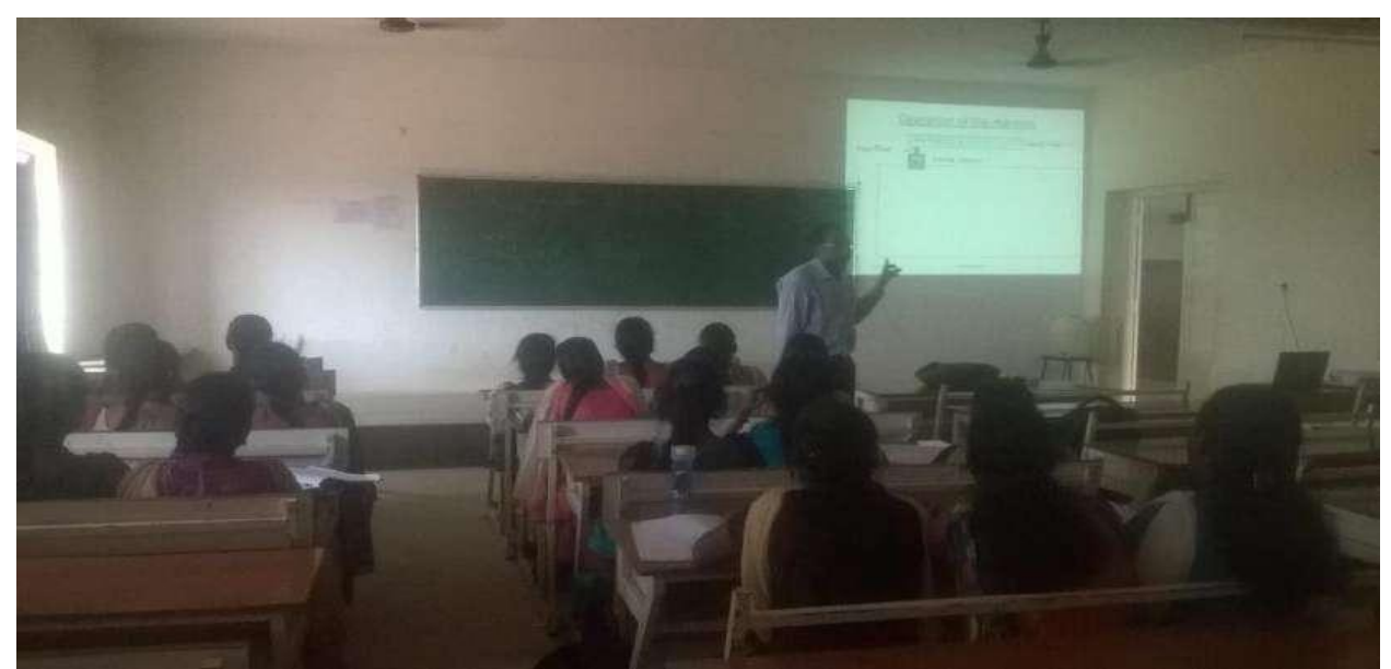
Virtual Lab Session on Cloud Computing for III Year - 39 students were attended