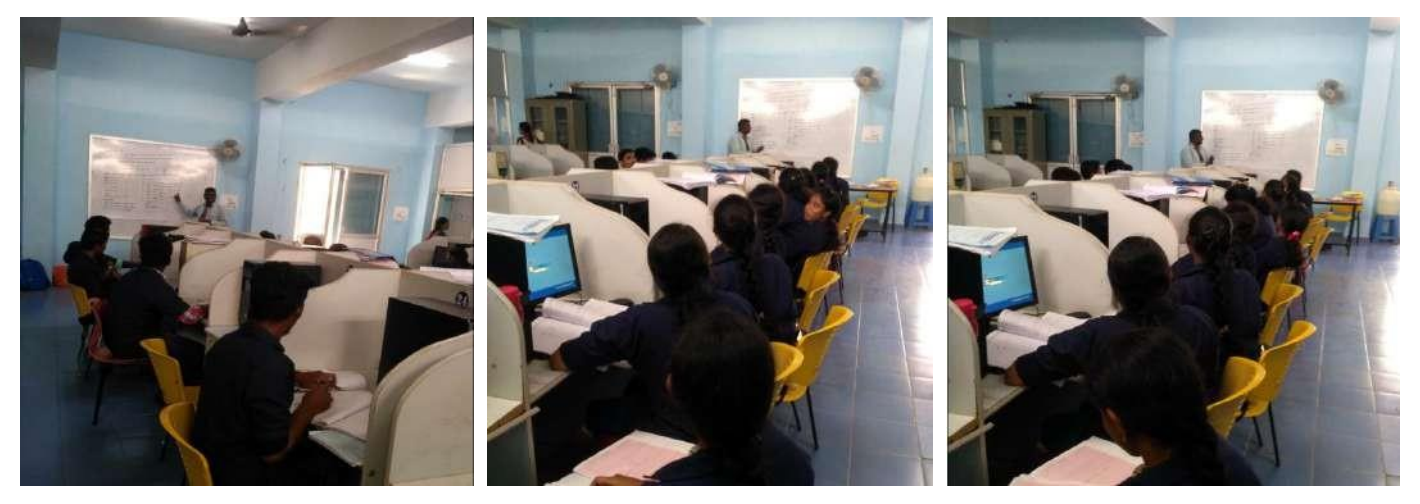
Mr. S.Ramarajan, AP/ECE handling the virtual lab session for II ECE students.

For second year students , the virtual lab session was conducted in the title of " Basic Electronics lab (Simulation Based) ". The topics covered under this title are BIT common emitter characteristics, BIT common Base characteristics, Zener diode voltage regulator, Study of BIT CE amplifier & RC differentiator and Integrator circuits.