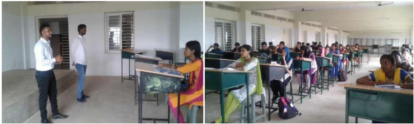
View of III Year students listening to Alumnus

Sharing interview tips, work experience and need for continuous skill upgradation among the juniors, Alumnus insisted juniors to be vibrant in preparing themselves to face the outside world. Also, insisted junior to opt suitable company (preferably start ups) for better learning environment. Various online resource links was shared for skill enrichment. Alumnus also informed juniors to be in networking with seniors for suitable references.