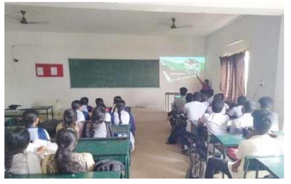
Virtual lab sessions - Environmental Engineering Laboratory