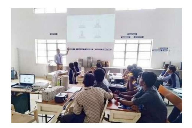
Virtual lab sessions - Concrete & Highway Engineering Laboratory